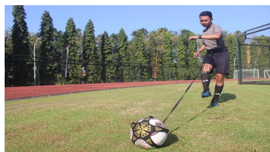
Figure 5: The application of IPTP Media.

This media or tools is consulted to the expert about the appropriateness of the tools developed and also tested the level of appropriateness of the media or tools start from small groups to large groups. The result of the consultation and the feasibility test to the respondent or the tools developed generally get the responses or results worthy of being used as a training medium in training football passing techniques for beginner athletes, it is based on expert judgment, which are the media expert percentage of 88% is in the very feasible category and the material expert percentage of 85% is in the very feasible category.