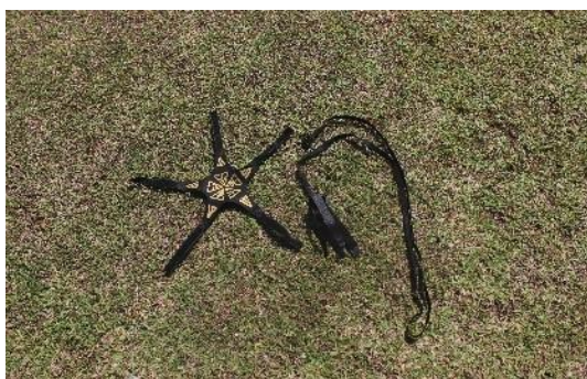
Figure 4: Independent Passing Drill.

Independent Passing Drills: It is an item which helps to increase the technique skills of football such as passing. This tool made from elastic rubber which can extend up to 4.5 m. Then it also consists of ball gloves made from neurophone that can be used using various sizes of football balls.