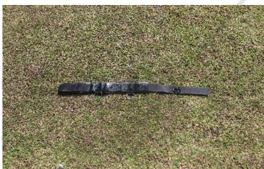
Figure 3: Multi-Function Waistband.

Multi-Function Waistband: It is a waistband made of foam material which is coated with neurophone so it is comfortable to use. This waistband serves to connect training items from the passing technique.