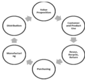
Figure 1: The main function of SSCM