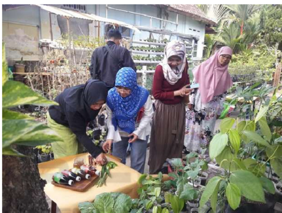
Figure 2. Training on the design of branding concepts through social media and other digital media.

Referring to the above activity items, the problems of the Kompak Jogis Community and the Forkom KaryaManunggalYogyakarta as a service partner carried out by the Universitas Pembangunan Nasional “Veteran” Yogyakarta include the following: