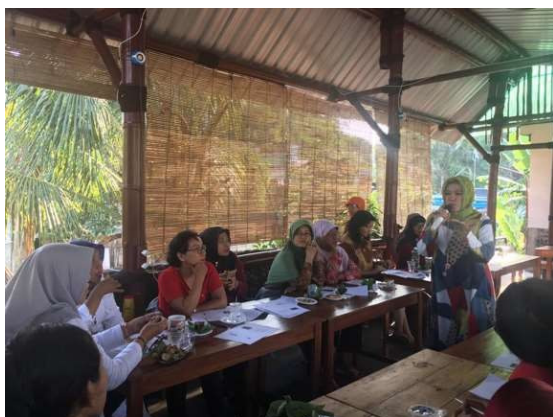
Figure 1: Socialization Activities of Intellectual Property Rights