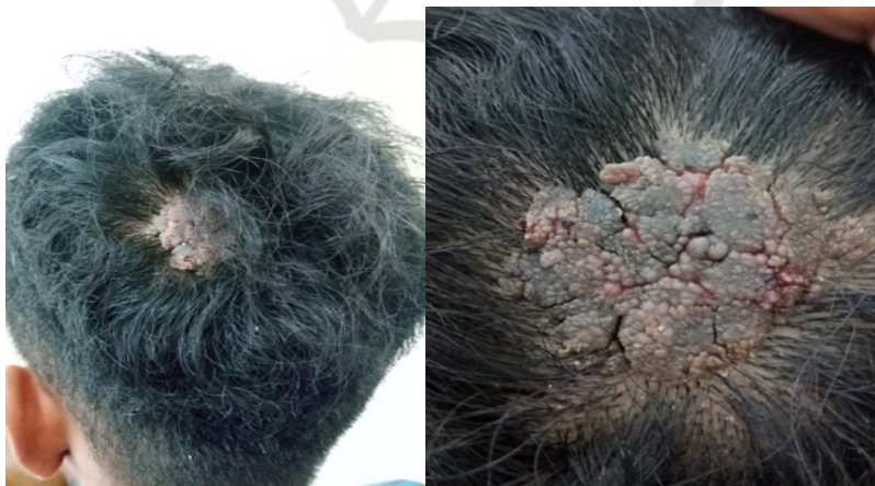
Picture 1. First clinical picture. (reference: private documentation of Prilly in 2018)

Histopathology finding showed that the tissue perform a papillomatosis growth, epidermal hyperplasia, acanthosis, hyperkeratosis and parakeratosis, hypergranulosis with rough clod of keratohyaline, it also showed the upper epidermis has small core of coil cell, and hyperchromatic that surrounded by empty cytoplasm. Papilla dermis showed dilated capillaries that contains erythrocyte. The dermis layer contains sebaceous glands, hair follicle, eccrine gland, and perivascular lymphocyte infiltration. The treatment comprise electrocauterization with local anesthesia (scar tissue presence after healing process), analgetic (mefenamic acid 500mg t.i.d / p.o), wound compress with gauze using normal saline 0,9% (1x10 minutes before topical application), oral antibiotic (cefadroxile 500mg b.i.d / p.o for 5 days), topical antibiotic (fusidic acid 2 times a day/ TP), and multivitamin (vitamin B complex and vitamin C q.d / p.o for 5 days).