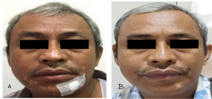
Figure 1. (A) Examination on the first month (B) Examination on the fourth month