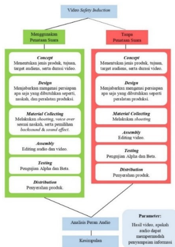
Figure 2: Design phases of Luther-Sutopo.

The Luther-Sutopo multimedia development methodology consists of 6 (six) stages, namely concept (concept), design (design), material collection (material collecting), manufacture (assembly), testing (testing) and distribution (distribution) (Binanto, 2015). The use of the Luther-Sutopo method can produce products that are programmed to solve problems with research needs (Saputro, 2019).