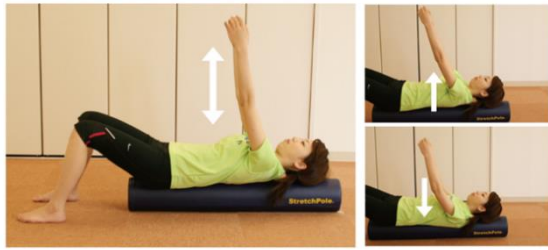
Figure 2: Examples of exercise. (Stretch Pole Official Blog( https://stretchpole-blog.com/stretchpole/stretchpole-use )).