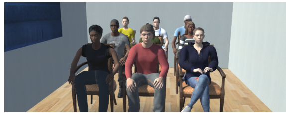
(a) The Ingroup condition

The only difference between the conditions was the physical appearance of the virtual audience. In the Ingroup condition the avatars were physically smaller, and they wore bright colours and informal clothes. The avatars in the outgroup condition were bigger and wore toned down colours and formal clothes (see figure 1).