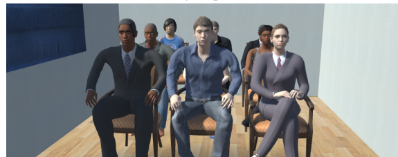
(b) The Outgroup condition