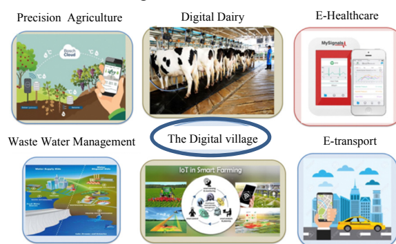
Figure 1: The digital village concept (Illustration).

The idea is to develop a holistic remote and local sensing methods using both spectral imaging and Micro and Nano sensor based digitalized information and communication technology (ICT) for the farmer