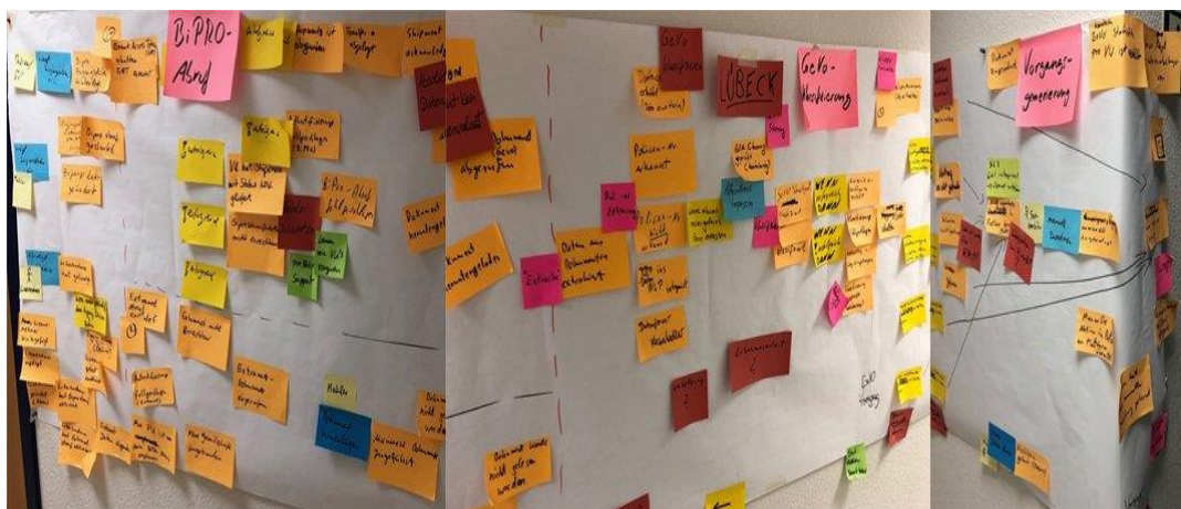
Figure 1: First Vision of GeVo Service created by Event Storming Method.