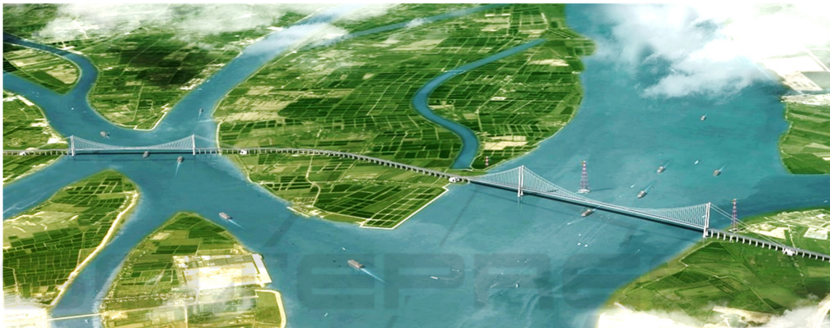
Figure 2: Over view of the Nansah Bridge Project.

billion yuan, including two kilometer-class suspension bridges. At the beginning of 2015, the BIM application during the construction period of Nansha Bridge was officially launched. The project aims at digital design, digital construction and intelligent management. Five key technologies, including the BIM standard application mode for super-large highway bridges, the integration of BIM in steel girder design and fabrication, management of short-term assembly segment beams with IOT technology, BIM platform for collaborative management, and application guidelines of BIM technology in mega bridge construction projects, have been developed.