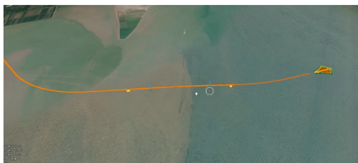
Figure 3: The BIM platform for Shenzhen-Zhongshan Link.

Based on the work of the Nansha Bridge, the Shenzhen-Zhongshan Link has taken a big step forward in BIM application. However, in the actual application process of the project, there are still insufficient user habits and insufficient information system assessment and reward mechanisms, which affects the enthusiasm of some participants in using the system. The mobile terminal has been able to achieve some basic functions, but the ability of approval management is not strong enough.