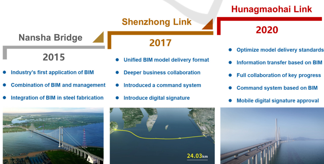
Figure 1: Over view of typical BIM applications in Guangdong Province.

In March 2020, the BIM and informatization work of the Huangmaohai Cross-sea Link was officially launched. The project fully inherited the technical foundation of the Shenzhen-Zhongshan Link and Nansha Bridge, pushing BIM and informatization application to a new level. The project focused on optimizing the coding collaboration system in depth, and improved the application level of project construction-quality inspection-metered payment collaboration. The project has developed an integrated BIM platform, carried out in-depth mining and analysis of multi-dimensional data, and introduced mobile digital signatures to push the informatization of engineering construction and management to a new level.