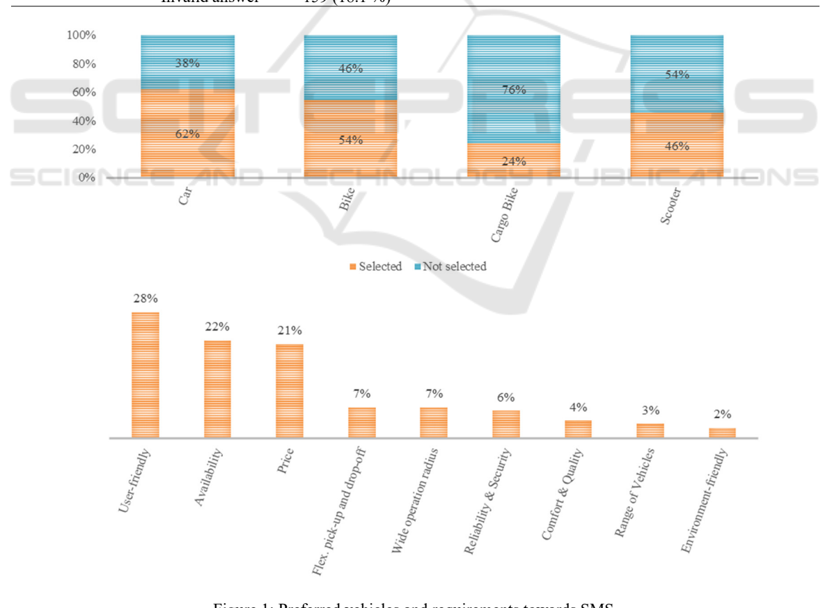
Figure 1: Preferred vehicles and requirements towards SMS.