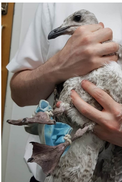
Figure 3: Vets were able to cut the mask off and the bird is now recovering (Williams 2020).