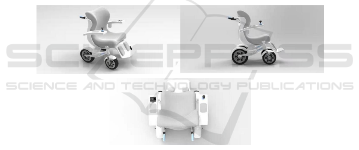
Figure 4: Appearance of the wheelchair (self-made).